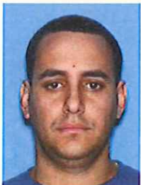
7 LEONARDO STATE MARINA Luis Salmon MAX FINE: $15,000 CHARGED