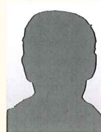
3 DELAWARE AND RARITAN CANAL STATE PARK Sibte Kashi MAX FINE: $250 CHARGED